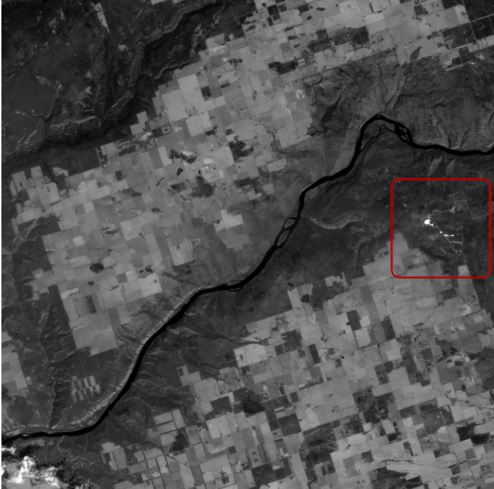
Wildfires close to crop fields in Alberta (Canada), imaged by DRAGO-2. Image in the 1.6 microns band. The fire location is marked in red.

https://www.iac.es/en/projects/iactec-space